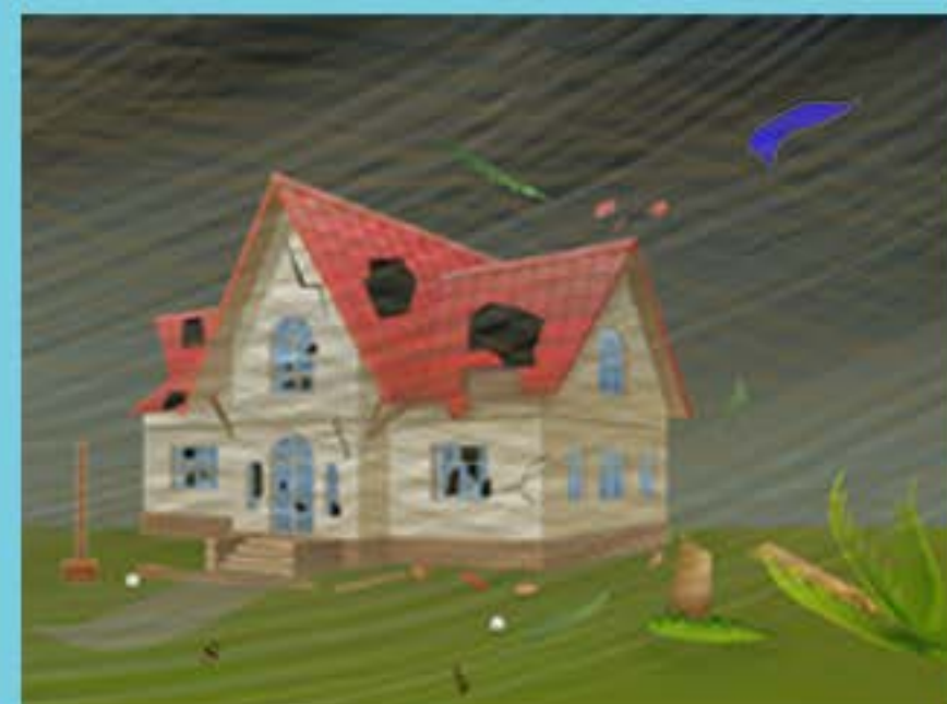
RIBUT GANAS > 86 km/j ⚠ AMBIL TINDAKAN AMARAN PERINGKAT MERAH