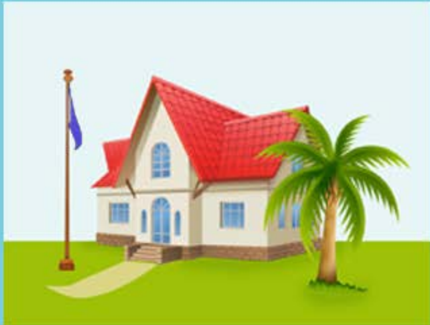
LIGHT BREEZE 6-11km/h