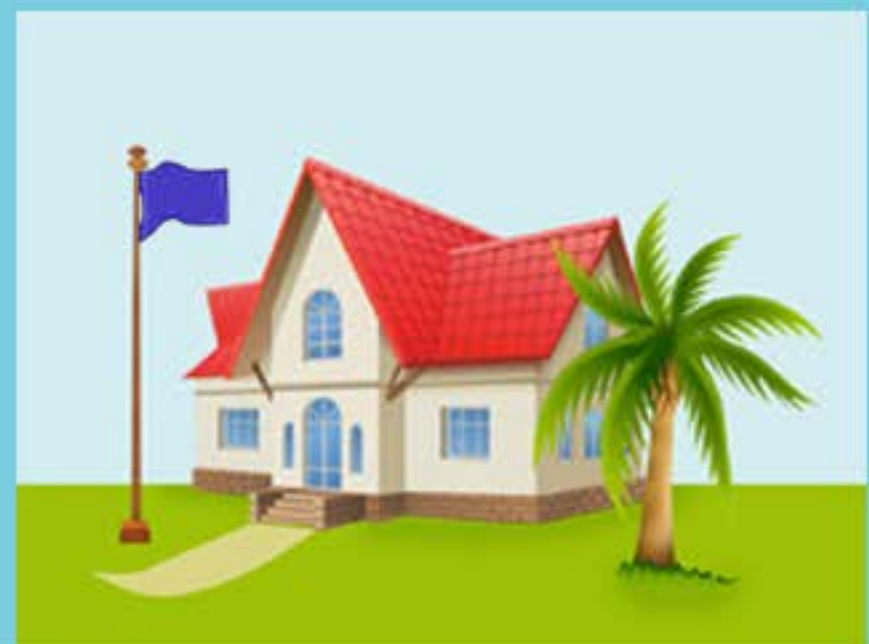
ANGIN LEMBUT - SEDERHANA 12 - 30 km/j