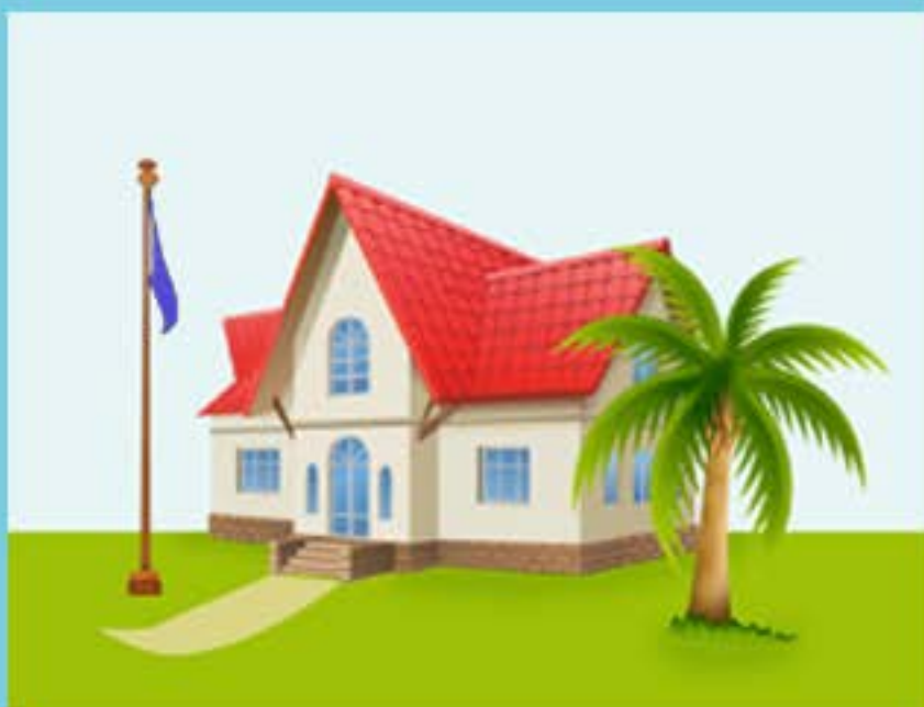
ANGIN SILIR 6 - 11 km/j