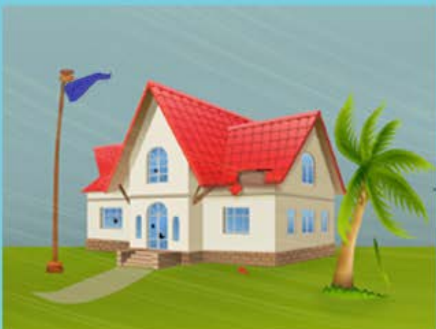
GALE 51-60 km/h ⚠ BE PREPARED AMBER STAGE WARNING