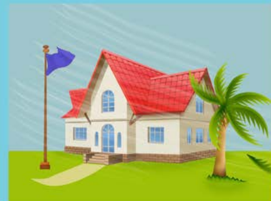
ANGIN KENCANG 39 - 50 km/j ⚠ BERWASPADA AMARAN PERINGKAT KUNING