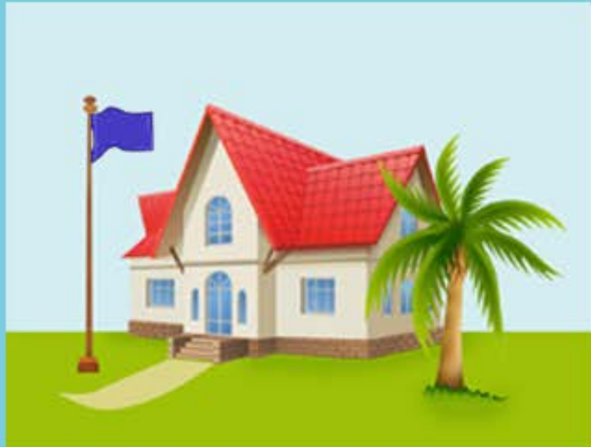
GENTLE - MODERATE BREEZE 12-30km/h