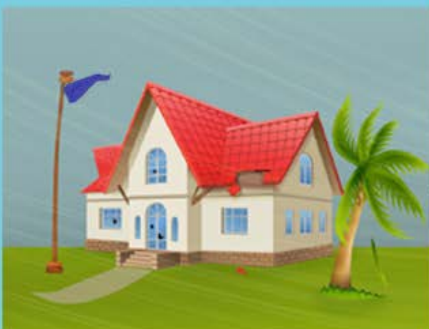
BEBADAI 51 - 60 km/j ⚠ BERSEDIA-SEDIA AMARAN PERINGKAT JINGGA