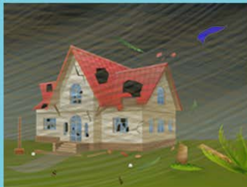
SEVERE STORM >86 km/h ⚠ TAKE ACTION RED STAGE WARNING