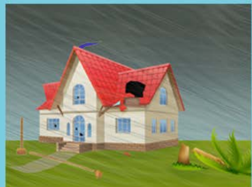
BEBADAI KENCANG 61 - 86 km/j ⚠ AMBIL TINDAKAN AMARAN PERINGKAT MERAH